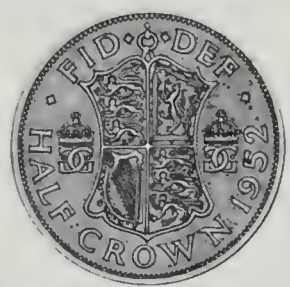
Lot No. 2938